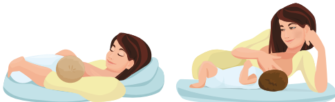
LAI D BACK POSITIONS