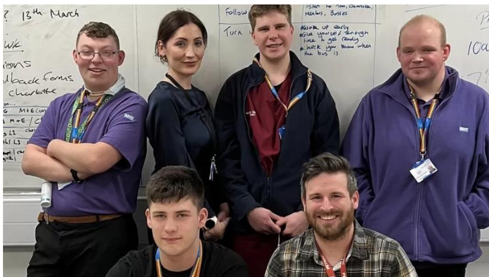
Four Project SEARCH interns working in our Eastern services in maintenance, healthcare assistant, and administration roles, with staff from Pluss and Petroc