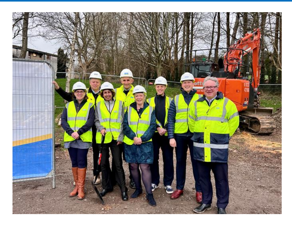
Members of the Our Future Hospital meet developers on site