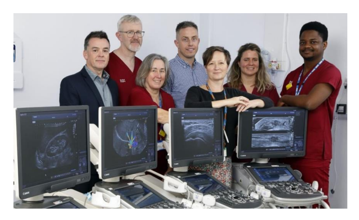
Staff at Devon Diagnostic Centre