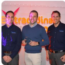
Dominic Hazell Green Award