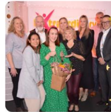
ICU Team NDDH Team of the Year Award