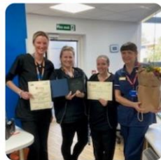
ED Reception Team NDDH Team of the Year (non-clinical)