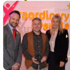
Mike Cousins Extraordinary Endeavour Award (non-clinical)