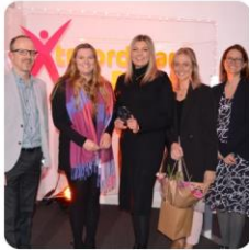
SWAOC Physiotherapy & Occupational Therapy Team Exceptional Idea Award