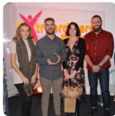
Pharmacy Aseptics Team Extraordinary Care Award (team)