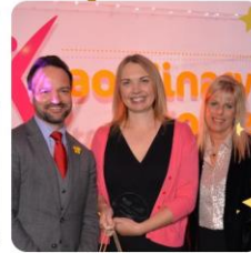
Hannah Hopkins Extraordinary Endeavour Award (clinical)